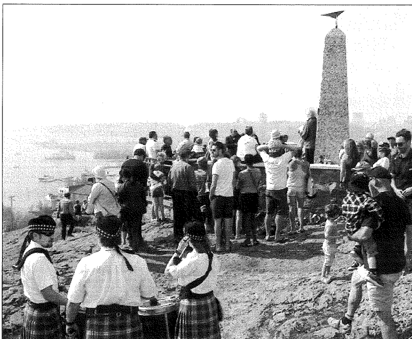
The pipe band takes a break as engines begin to thunder in the distance from Pilot's Monument on Sunday morning.